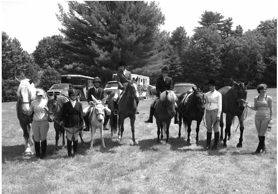
Our show group at the horse show at French Park, N. Egremont, 2010

Our therapy horses and donkey held their own in the local show ring. We are extremely proud of our helpers who put much time and effort into showing nine of our equines, and staying in the ribbons with each one! Our donkey Taquito won champion or reserve champion in each show he went to. Twist, our Belgian, also won reserve champion in 3 out of 4 shows. Congratulations to a job well done. It was great to show the community that our approach to horse care carries through all disciplines. We are excited to have a group of students who want to continue our showing career. Even though this isn't a priority or even an aim of our lessons, it is nice to see the lessons taught at our barn grow into a self-designated goal.