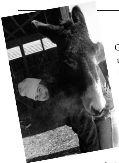
George the donkey has many friends at the barn

Now the ride begins back home. I hear breathing and excited happy words. "Did you see me? How did I do? I like riding! I love Willie Wonka!" The steps are clearer, the voices brighter, and the cheeks rosy! And so we look forward to our car ride next week. I see many behavior changes in all my ladies that ride; especially their self esteem and how proud they are to go back home and share their experiences with their peers. They love to share the name of the horse that they rode that day. My ladies seem less stressed and more focused as we leave the barn. I think they stand a little straighter each week and that we each leave the barn with a little more knowledge on how to take care of each other, animals, and our bodies.